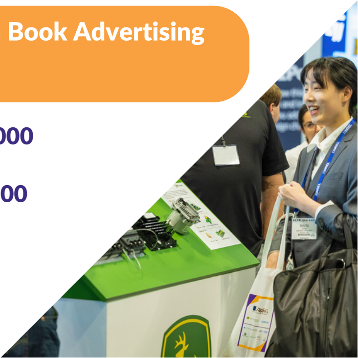
Exhibit Hall Days and Hours

Exhibitor Move-In Monday, October 21 8:30am-3:00pm