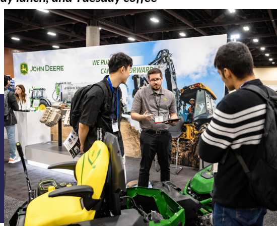
Exhibit Hall "A" Lunch @ 12pm Coffee Break 2pm

Tuesday | 10:30am-5:00pm Career Fair 8:30am - 11:30am